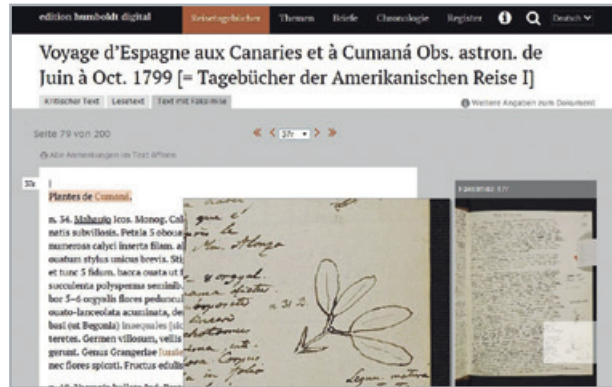
American Travel Journals, Vol. I, fol. 37r. Screenshot edition humboldt digital